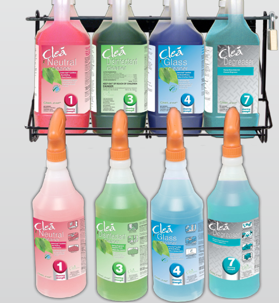
Locking Wire Basket CLWB-3